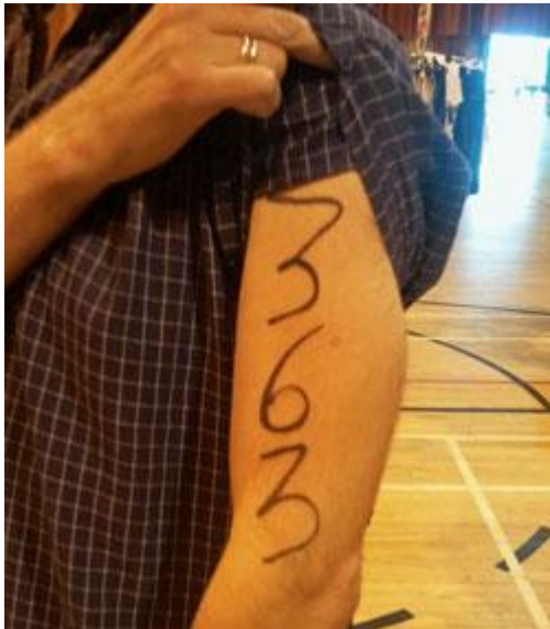
At least you don't need safety pins!

The event itself centred around Stratford Leisure Centre. It started with a 400m pool swim, a 23km bike ride and a 5k run - the sprint version of the discipline the poster said. Some sprint. We registered and collected our numbers. So far just like a standard road race. But, in addition to the vest number, we had our numbers written on our legs and arms. Now I felt like a proper triathlete.