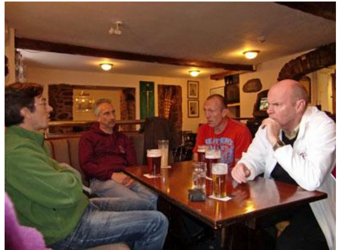
Pre-race: Note who has the only soft drink!

So there you have it, I’m not a Euro sceptic, just someone who runs an idiotic number of marathons!