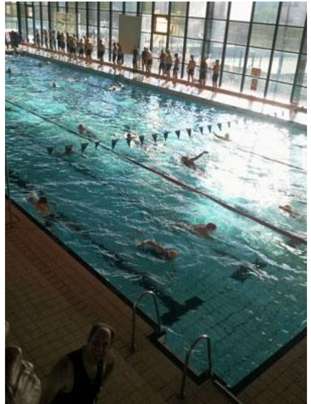
Too late for second thoughts, now

The next challenge was to find a spot in the transition area. The place was full of bikes, plastic boxes, shoes .... and two novices wandering round like Saturday shoppers trying to park in the Shires just before Christmas, but we soon got the idea and squeezed in where there was an inch of daylight. Now it was time to layout our kit. The websites and books describe how to do it properly, yeah - in an ideal world. Here you just do the best you can.